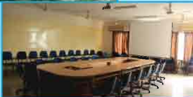
CDD Conference hall