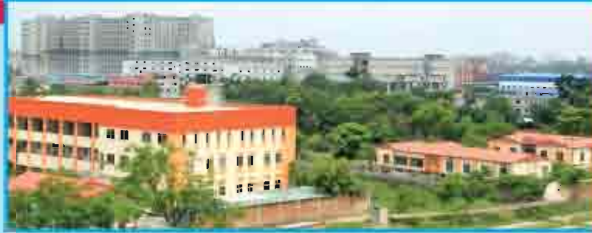
Office building and training complex