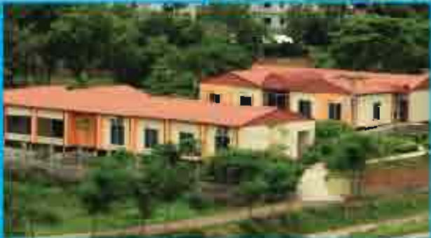
Entrance of training complex